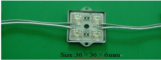
Size: 36 × 36 × 6mm